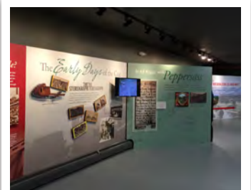
New Railway Museum!