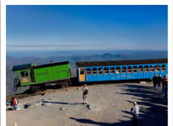
Enjoy Summit Activities