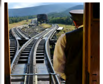
A Historic & Scenic Train Ride