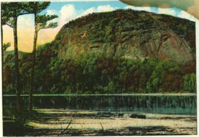
ECHO LAKE AND WHITE HORSE LEDGE, NO. CONWAY, N. H.