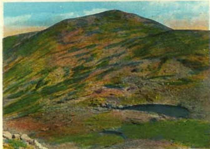
LAKE OF THE CLOUDS, WHITE MTS., N. H.

One of the new Notch folders. Here not heard from you since I left. Hope you are all right - all seem to be well.