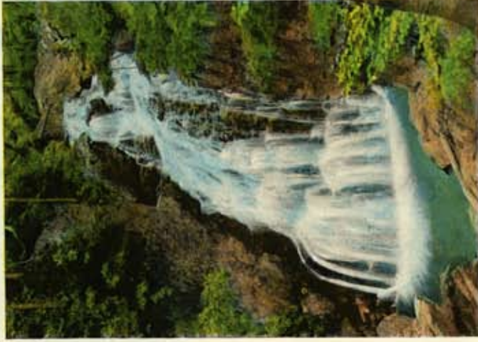
CRYSTAL CASCADE, PINKHAM NOTCH, WHITE MTS., N. H.