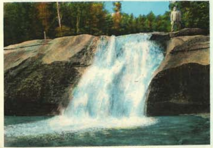
OLIANA'S BATHS, WHITE MTS., N. H.